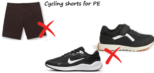
Cycling shorts for PE