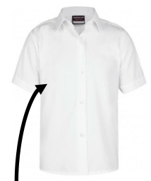
KS2 White shirt with long or short sleeves

ONLY agreed items may be worn as school uniform