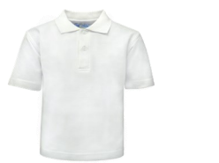
KS1 White Polo Shirt